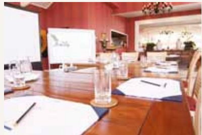
PEPPERS ON THE POINT CONFERENCE FACT SHEET